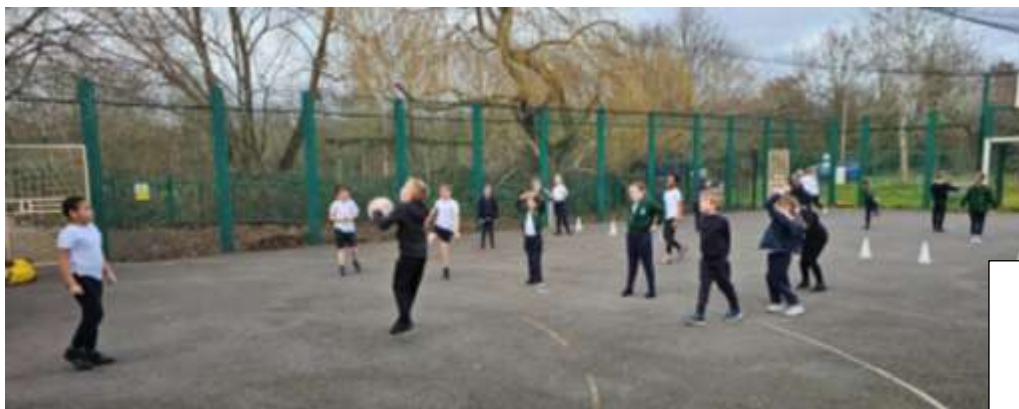
Our PE session